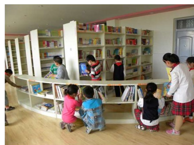
The library at Gedadian Primary School is very popular with the students