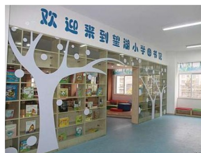
Wanghu Primary School has the biggest library of all the schools in the Alliance

Compared with overseas countries or Hong Kong and Macau, Mainland China is still in its exploratory stage in terms of