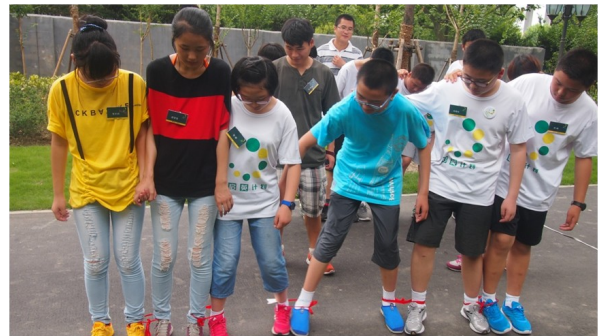
Team play aims to help the students face problems as a team, understand and respect their teammates, and find solutions together.

The summer camp is part of the Qidong Youth Outreach Project supported by the Chen Yet-Sen Family Foundation. During the camp, 12 trainees from Qidong Nanyuan Middle School, Qidong Zhegui Nanyuan Middle School and Qidong Jianxin Middle School completed two gold medal courses