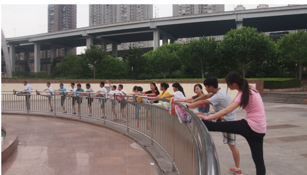
2km morning exercise and leg stretching exercises are mandatory for each day of the 3-day base training

This was the first time that the trainees participating in the summer camp had ever experienced such a hard, challenging but enjoyable trip.