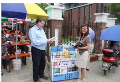
Jincheng Primary School created a reading area for waiting parents