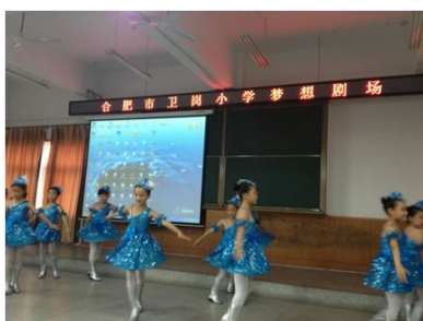
Dance performance of the picture book Belinda the Ballerina at Weigang Primary School

During the meeting, Education Bureau officials and guests from the Foundation visited two of the Alliance's sponsoring schools,